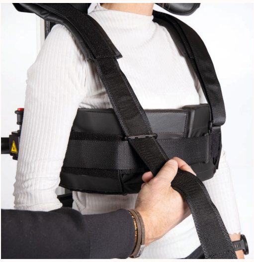
• Upper body support