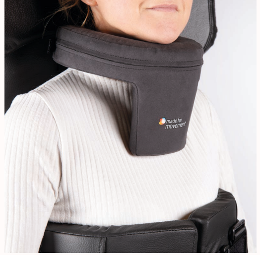
• Supports the head