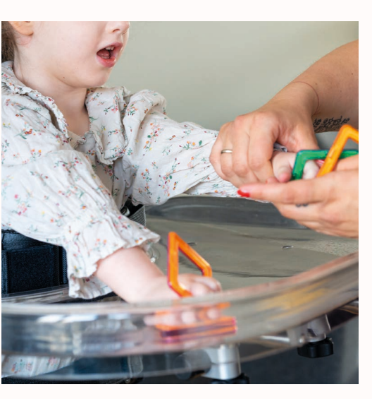
TRAY Swing away function (optional side left/right)